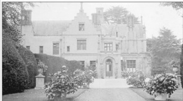
AS IT WAS: The now demolished High House in Campsea Ash Park ref: ch 06 Campsea Ash 14